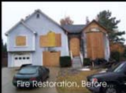
Fire Restoration, Before...